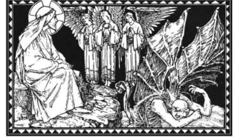
MASS READINGS FOR THE WEEK

Mon., Mar. 10 - Lenten Weekday - Lv 19:1-2, 11-18 / Ps 19:8-10,15 / Mt 25:31-46 Tues., Mar. 11 - Lenten Weekday - Is 55:10-11 / Ps 34:4-7, 16-19 / Mt 6:7-15 Wed., Mar. 12 - Lenten Weekday - Jon